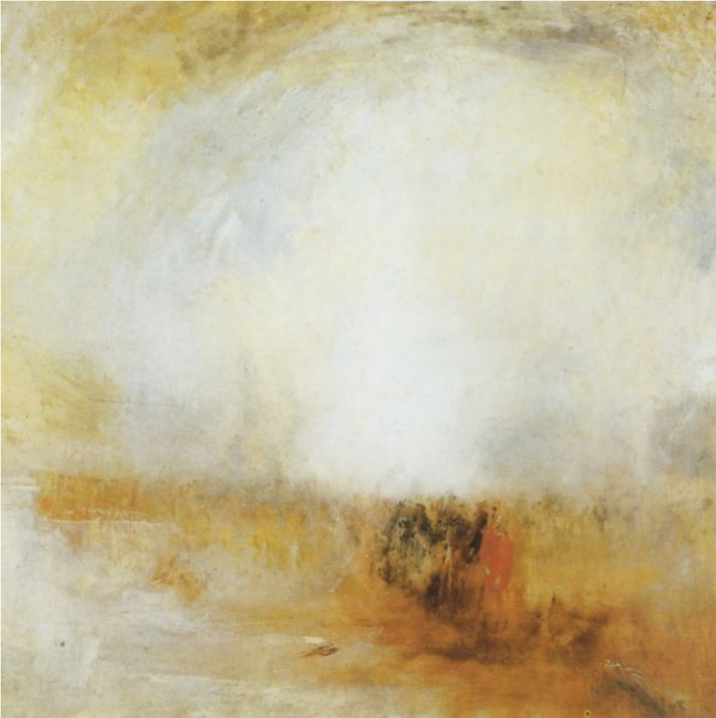
William Turner: Venetian Scene, 1940-45, London, The Tate Gallery, CC BY-SA 2.0 de