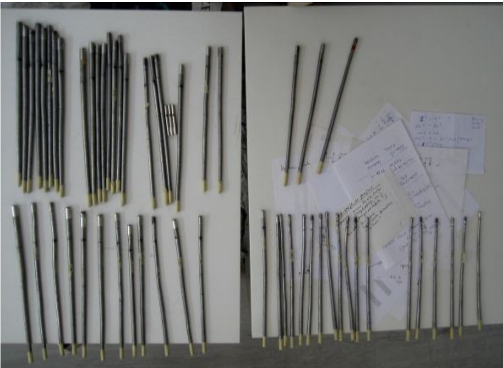
organ pipes, the 1-foot register