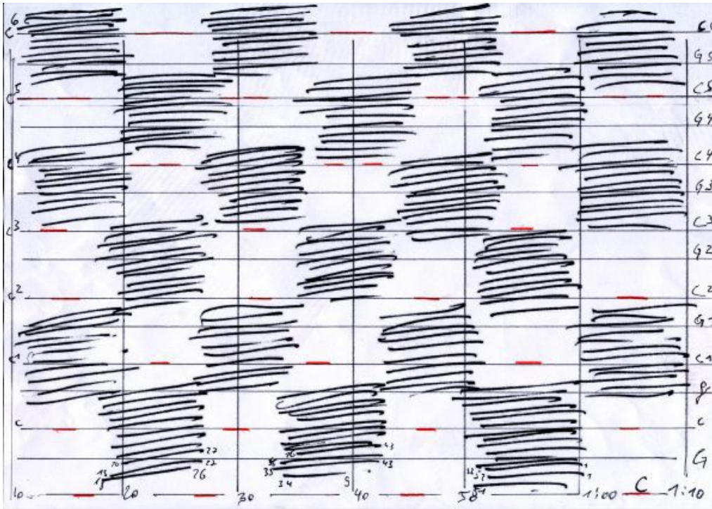
"Drawing IV" with indications of register and time grid (in 10-seconds intervals)