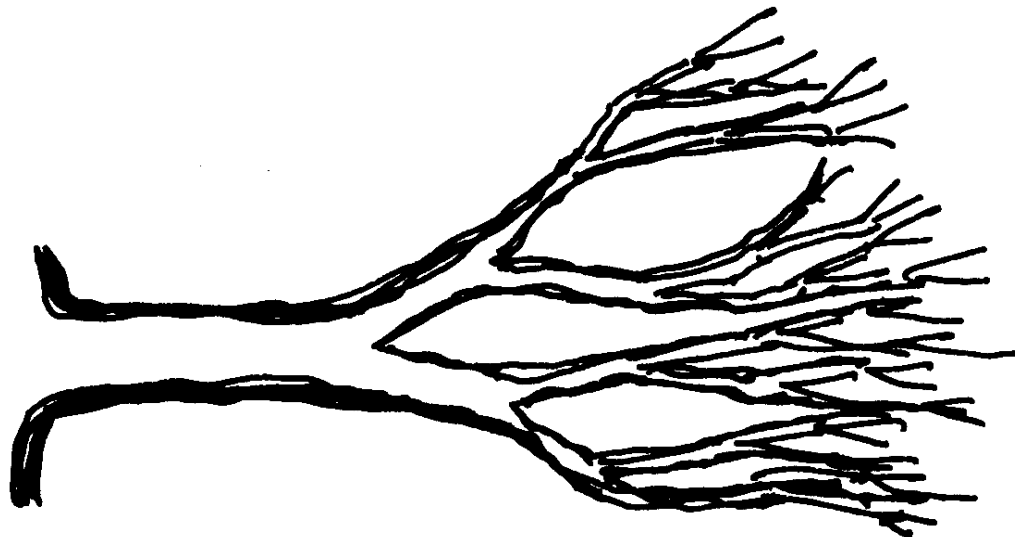
score for "Baum" ("tree") for 32 glissando flutes (draft)

"Against Nature", extended flute project, 52', 2020